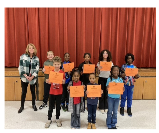
Super Attendance 3 or less tardies 1st Marking Period