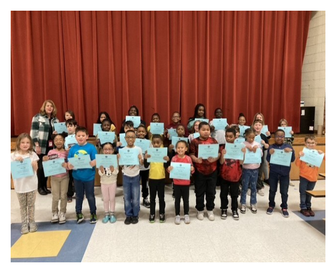
Perfect Attendance 1st Marking Period