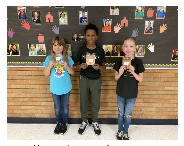
Walk a thon winners!!