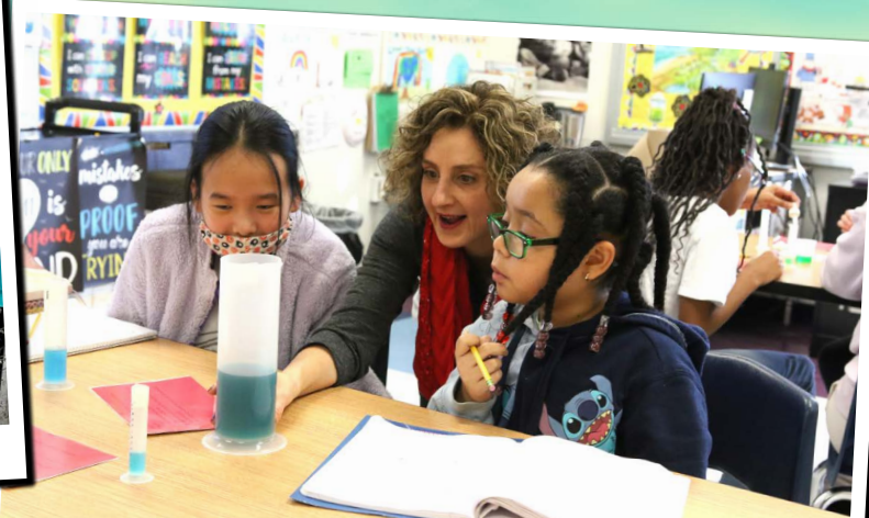
Gifted & Talented Program students working on units of measurement in February