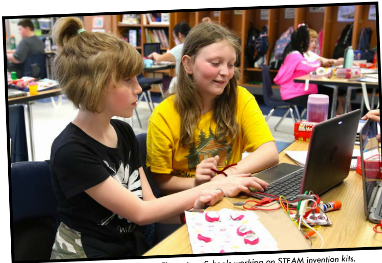
Students from Green and Patton Elementary Schools working on STEAM invention kits.