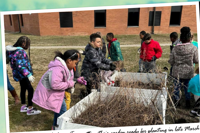
Dorst Elementary's Green Team getting their garden ready for planting in late March