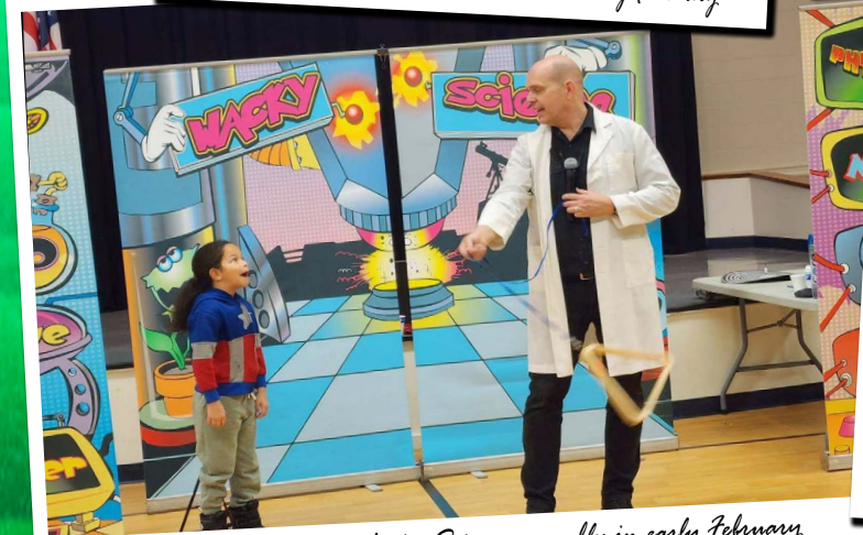
Patton students enjoy a Wacky Science assembly in early February