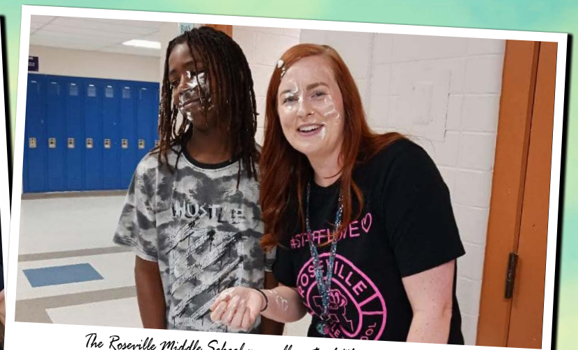
The Roseville Middle School pep rally got a little messy in late March