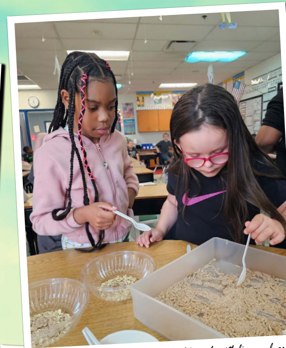
Steinland Students learning about the life cycle with live mealworms