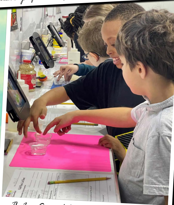
The Farm Science Lab visited Kmet in early February