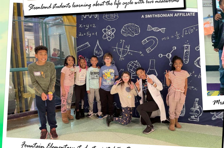
Fountain Elementary students visited the Science Center in early February