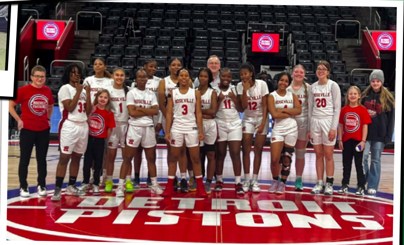
The Lady Panthers played a game at Little Caesars Arena in early February