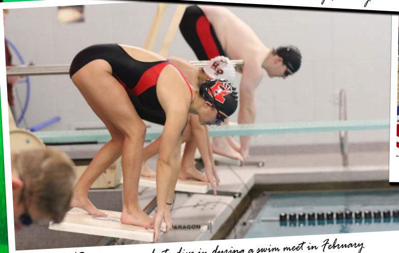
RHS swimmers ready to dive in during a swim meet in February