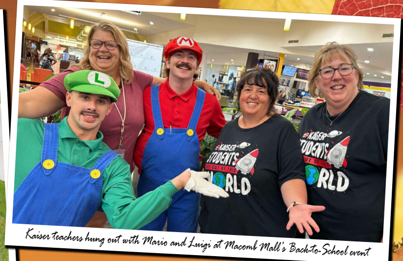
Kaiser teachers hung out with Mario and Luigi at Macomb Mall's Back-to-School event.