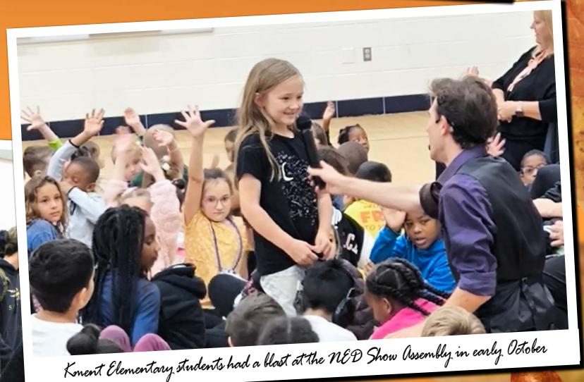
Knerst Elementary students had a blast at the NED Show Assembly in early October.