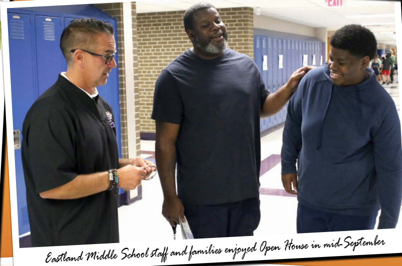
Eastland Middle School staff and families enjoyed Open House in mid-September.