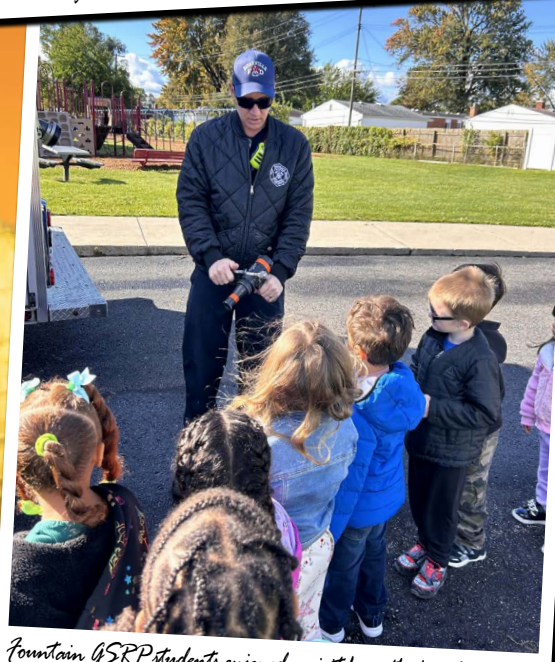
Fountain GSRP students enjoyed a visit from the fire department.