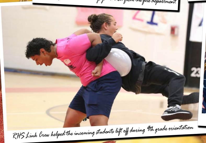
RHS Link Crew helped the incoming students lift off during 4th grade orientation.