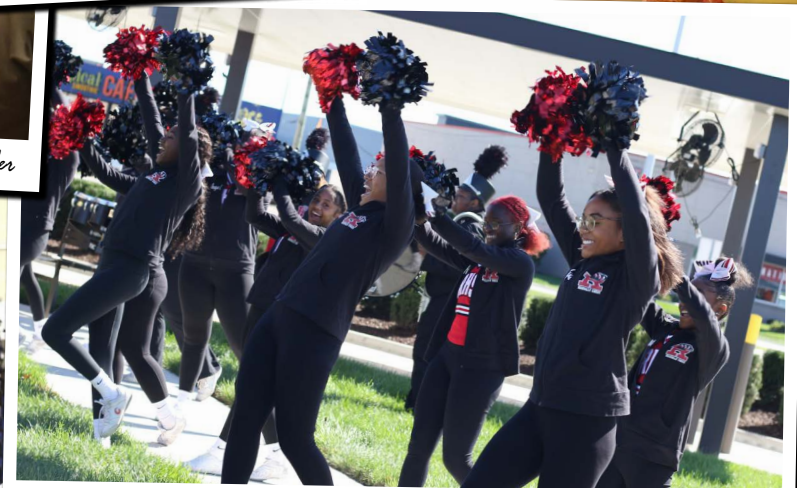
The RHS marching band and cheer team helped celebrate the opening of Chick-fil-A.