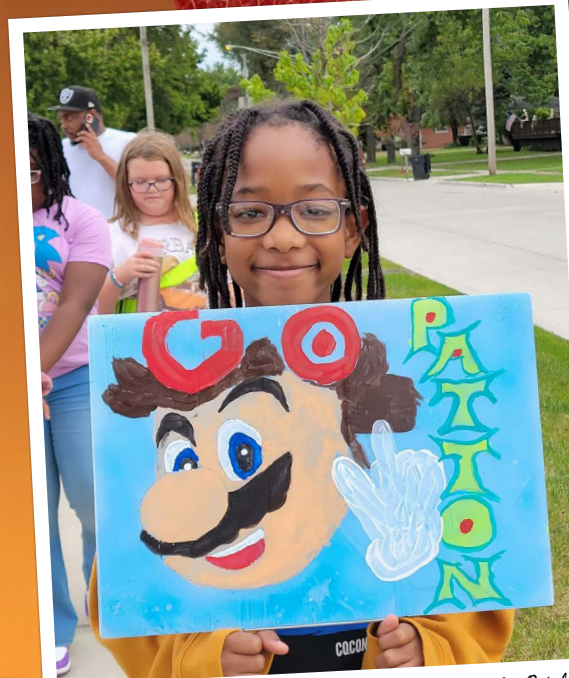
Patton students rocked their Walk-a-Thon in early October.