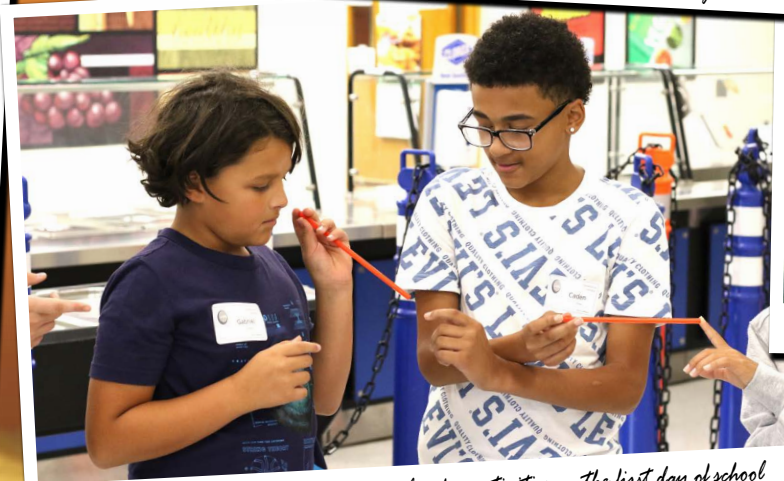
RMS 6th graders participated in icebreaker activities on the first day of school.