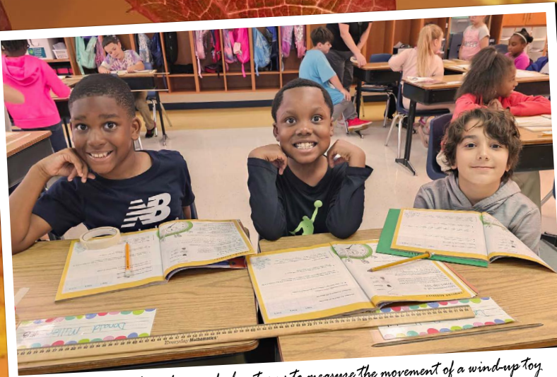
Steenland third graders worked as teams to measure the movement of a wind-up toy.