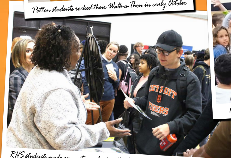
RHS students made connections during the 4th annual Career Fair in early October.