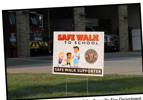
“Safe Walk to School” sign in front of the Roseville Fire Department.